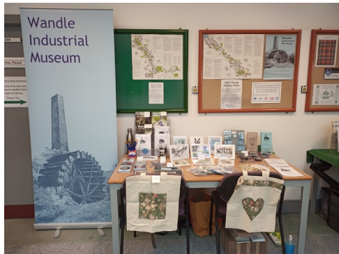
Our stall at the Merton Heritage Discovery Day

Regular events are slowly getting back to some kind of normality and so we were able to have our usual stall and children's craft workshop at Merton Heritage's Discovery Day at Merton Civic Centre on August 21 st . There were fewer visitors in general but plenty of activity surrounding the "Womble" mascots for the two Wimbledon football teams in the foyer.